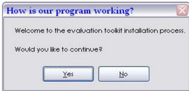
Figure 1. Install Toolkit

From Windows Explorer, double-click on the file named "Evaluation Toolkit.exe". Once you double-click on this file, you will see the message shown in figure 1 below.