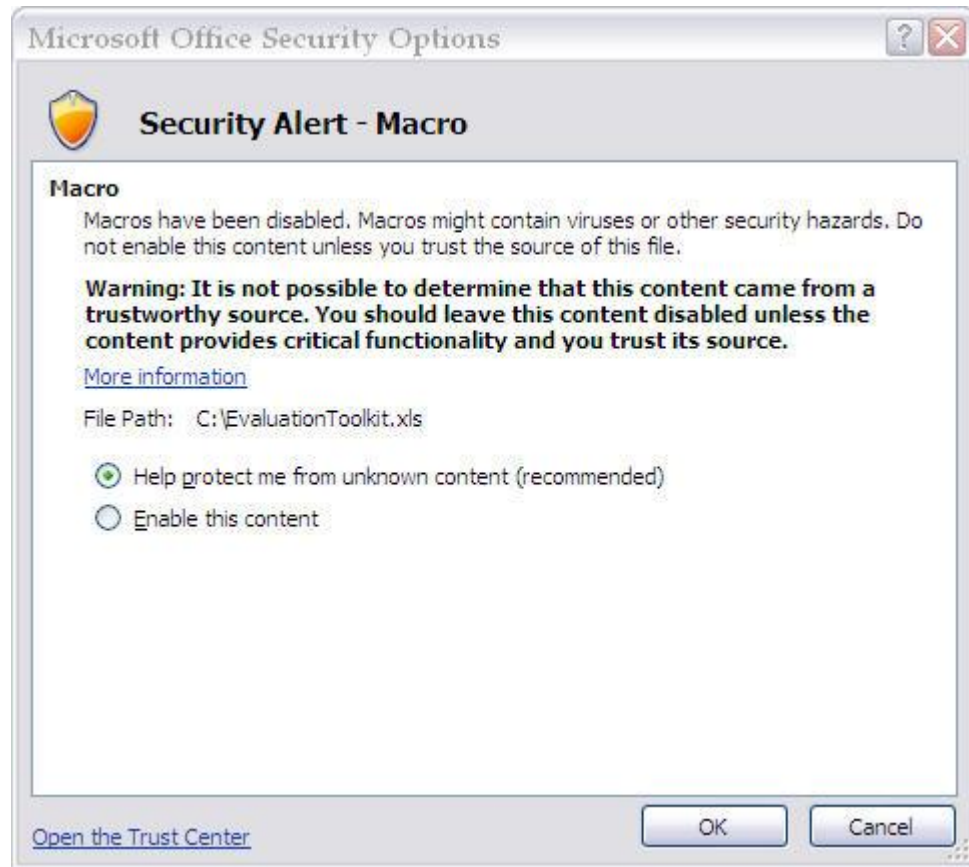
Figure 6. Microsoft Excel 2007 macro security alert – enable macros

Once you see the window shown in figure 6 above, first select “Enable this content” by clicking on the small white circle to the left of the label. Then click on the “OK” button on the bottom of the window.