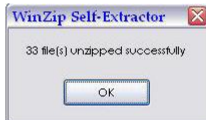
Figure 3. Toolkit files extraction confirmation.

Please note: The computer network administrator in your organization may have restricted your ability to download to the "program files" folder on your computer. If this default location is restricted, you can change the location where the program will be installed by clicking on the "Browse" button shown in figure 2 above. However, for easy access, we recommend saving the files in the default location specified. Please make sure not to deselect the two options identified with green check-marks in figure 2 above. Deselecting these options will result in improper set-up. Click on the "Unzip" button to extract the files to your local drive. Once the files have been extracted, you will see a confirmation message shown in figure 3 below.