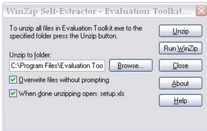
Figure 2. Unzip files to local drive.

Once you click on the "Yes" button in step 1 shown above, you will be asked to unzip the Toolkit files to a folder on your computer (as shown in figure 2 below).