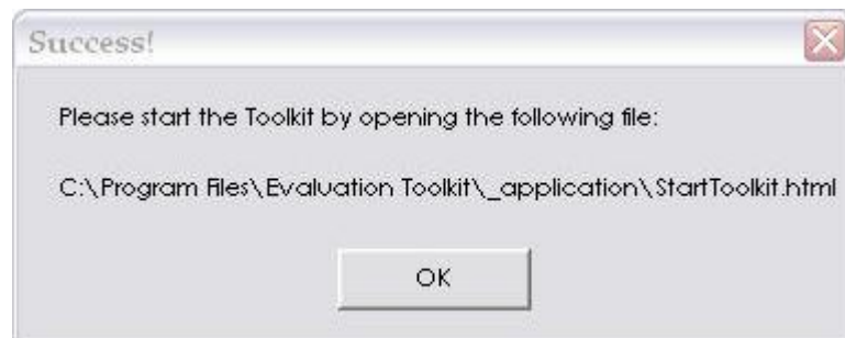
Figure 7. Toolkit files set-up confirmation.

Once the macros are enabled, the installation program sets-up the files on your computer and will display a confirmation message as shown in figure 7 below.